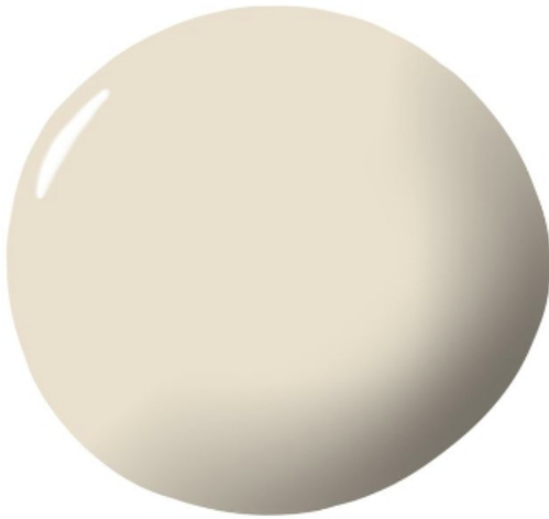
Farrow & Ball

"My favorite cream paint is Benjamin Moore OC-45 Swiss Coffee. It's the perfect creamy white, with a touch of beige and grey. I have it all over my home and have used it in many other homes. It's warm and inviting while still modern and clean." — Danielle Fennoy, Revamp Interior Design